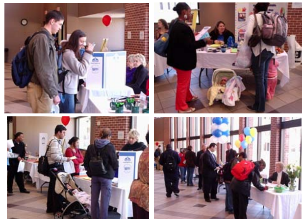
Scenes from the Housing & Child Care Information Fair

Although this was the third year that off-campus housing vendors participated in the fair, this was the first year for child care facilitators to reach out to students. The goal was to allow students to talk directly with housing and child care representatives to find solutions for their living or child care needs. For information from the fair, visit ACSS in UC 424.