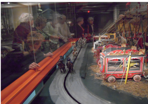
UMAR Pink Palace visitors revive their childhood awe of the miniature circus and marvel at its restoration to working order.