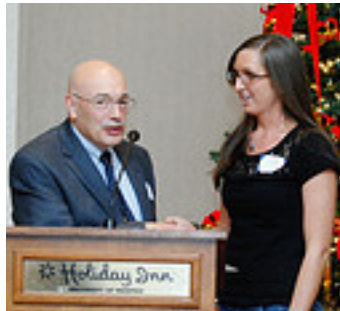
Bob Boone presents award