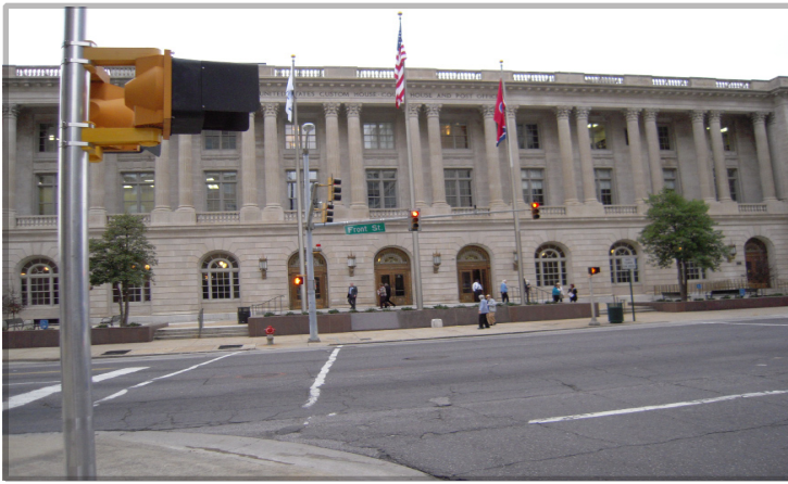
Outside the new law school with anticipation