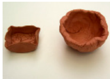
Pottery: (ages 6 & up) make your own vessel, pot, or bowl. $1 each