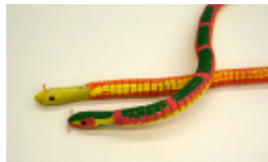
Paint a snake (ages 6 & up) hear the story of the sinti (snake) and paint your own snake. $2 each