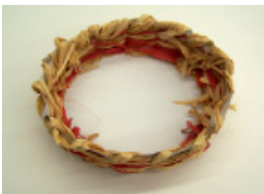
Weaving (4 choices /age groups): (ages 8 & up) weave a mat or basket. $2 each