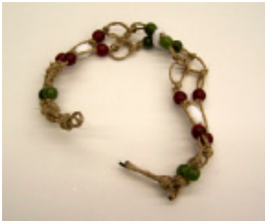
Beading: (ages 8 & up) create your own bracelet - $2 each

Along with the crafts available at no additional charge, listed below we are pleased to offer all new craft activities (30 - 45 minutes each) at a cost ranging from $1.00 - $2.00 per student.