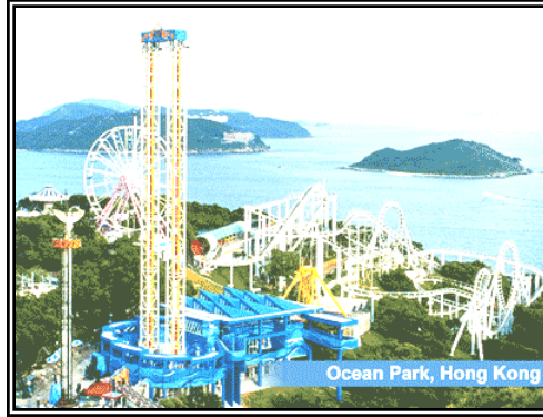
Ocean Park, Hong Kong

I would like to recommend that you travel to some places, such as Ocean Park, Disneyland, Tin Tan Big Buddha, etc. Ocean Park is the biggest theme park in Hong Kong. Two panda couples live there, and also more than one thousand kinds of marine life are shown too. Over thirty kinds of amusement rides and cable cars can be ridden. Hong Kong's Disneyland is the smallest in the world, however it has everything that the others have. It opened four years ago, and it has been extending, it will be finished within the next 4 years.