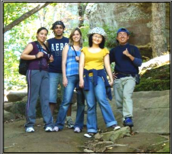
Campers at Petit Jean

On Ramadan we have a special days such as the nights of the 15, 19, 20, 21, 22, 23, and the ten ending days of Ramadan. On these ten days we have a special night we call it the night of Al-Qadir, but we don't know which night it will be. On the night of Al-Qadir we do a special worship for Allah ( The God ) and ask Allah to forgive us if we did something wrong.