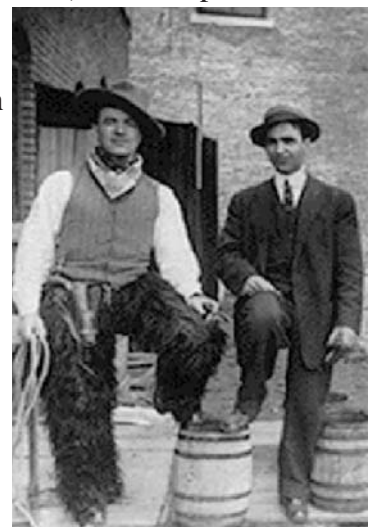
From West of Hester Street a film to be shown on April 18, 2:00 p.m., MJCC