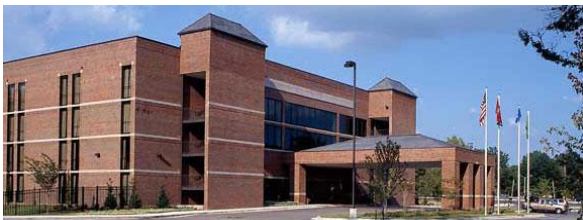
Kemmons-Wilson Holiday Inn