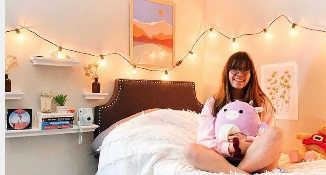
Modern Spaces - Traditional & Apartment Style