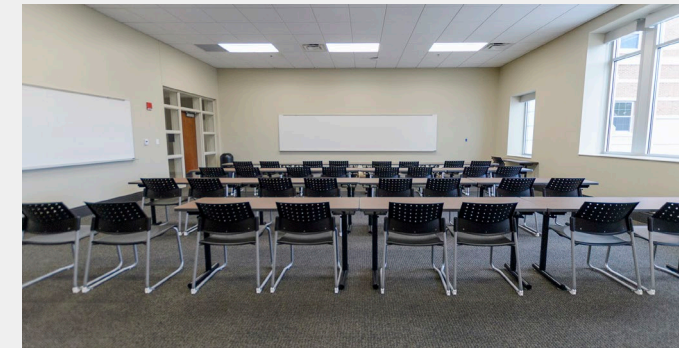
More Than Just A Place To Sleep - Tutoring, Study Lounges & More