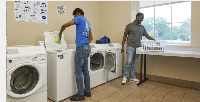
Amenities - Free Wi-Fi, Cable, Laundry Facilities