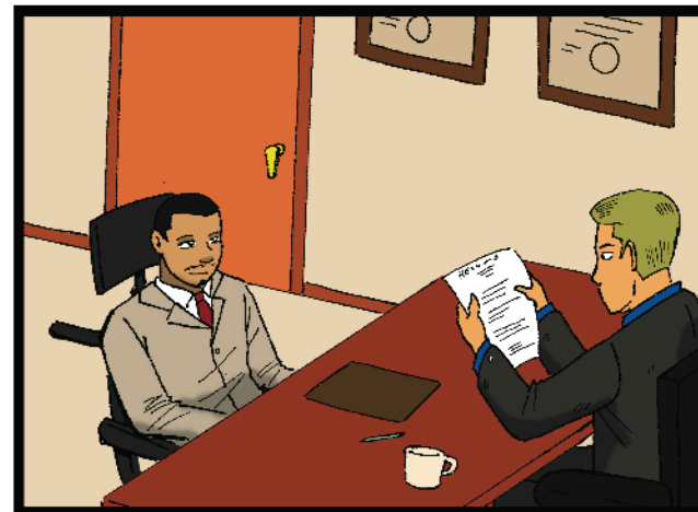
Interviewing For a Job