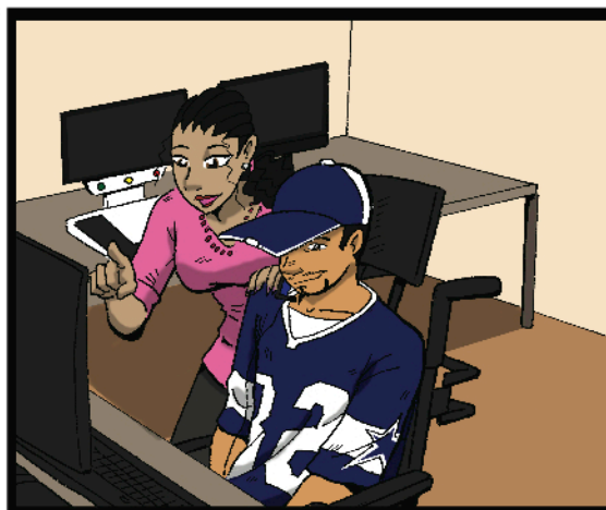
Assistive Technology (AT) Training