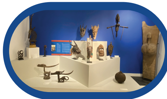
The permanent exhibit Africa: Visual Arts of a Continent located within the Art Museum of the University of Memphis