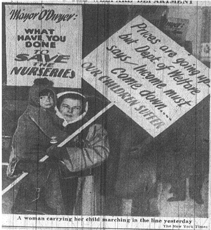
From "Mothers Protest Day Nursery Cuts," The New York Times , February 3, 1948.

This research is made possible through the financial support of the W. T. Grant Foundation (Grant # 2541)