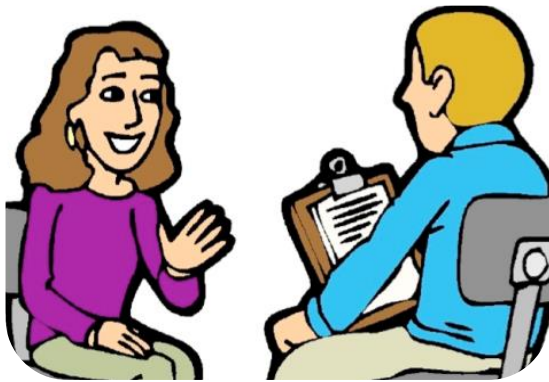
Know Your Professors