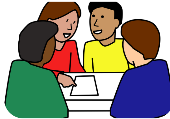
Develop Social Connections