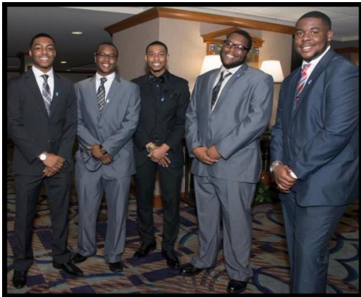
HAAMI students celebrate a successful year at the Hooks Gala. April 20, 2017.

What better way for the Hooks Institute to celebrate its 20th anniversary than by developing the personal, social, and academic skills of African American Men at the UofM? While African American male students are tremendously talented and ambitious, they are among the lowest graduating groups at the UofM. The Hooks African American Male Initiative (HAAMI) focuses on increasing their retention and graduation rates through intensive academic, social, and cultural coaching and mentoring.