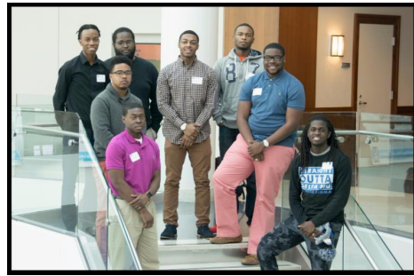
HAAMI students at a monthly session

HAAMI is successful in large part because of the commitment of the HAAMI members to positively shaping a future that includes their personal and professional success. Additionally, the Hooks Institute is proud of the collaborations that make HAAMI possible: committed students, community members, businesses, and the staff of the Hooks Institute. Together we can build a strong Memphis and nation by investing in African American male success.