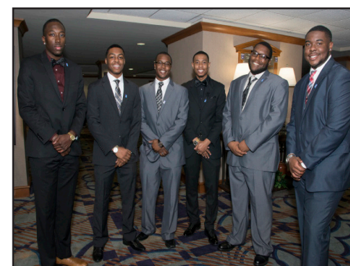
HAAMI members celebrate a successful year at the 2017 Hooks Gala, April 20, 2017.

HARNESSING THE POWER OF TALENT: AFRICAN-AMERICAN MALE STUDENTS