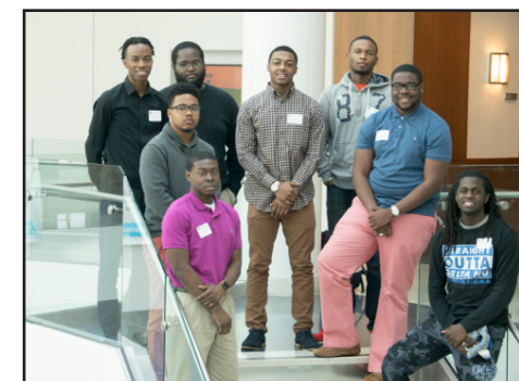
HAAMI members at monthly session.

For more about HAAMI, contact Rorie Trammel at rtrammel@memphis.edu or 901-678-4654, or visit www.memphis.edu/benhooks/haami .