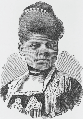
IDA B. WELLS.