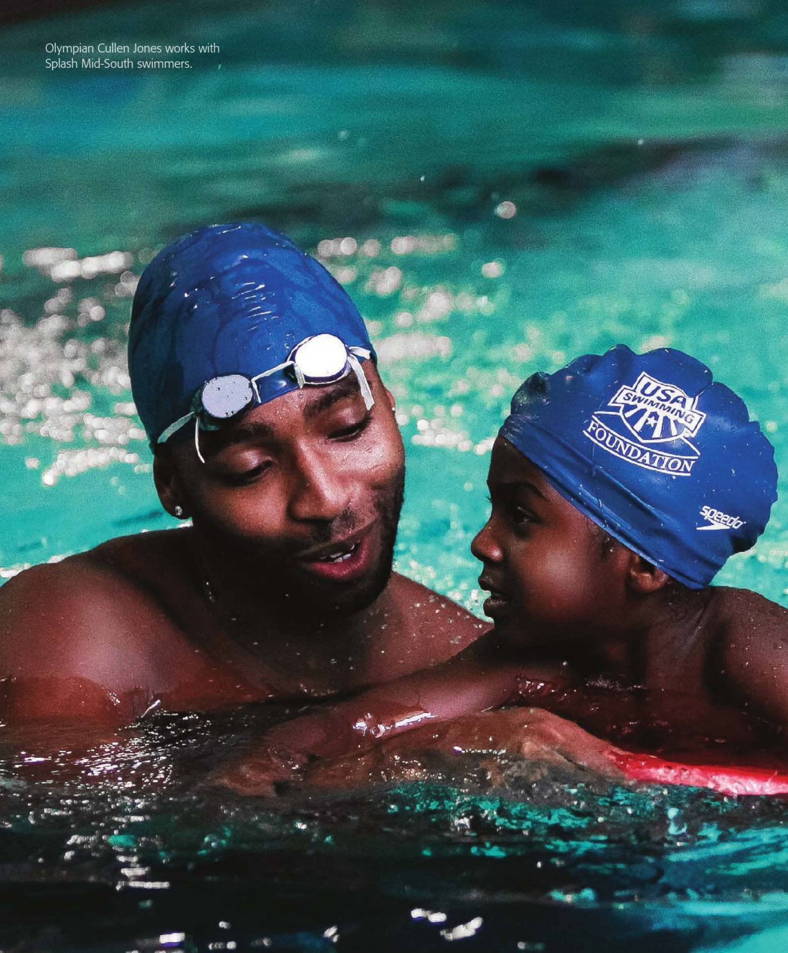
Olympian Cullen Jones works with Splash Mid-South swimmers.