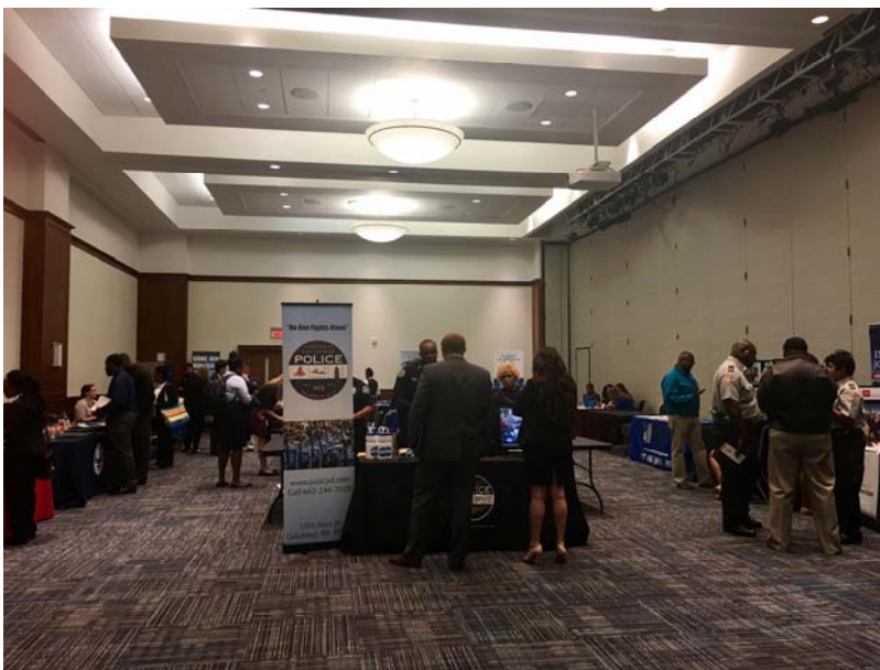
Students speaking with representatives from various criminal justice agencies.