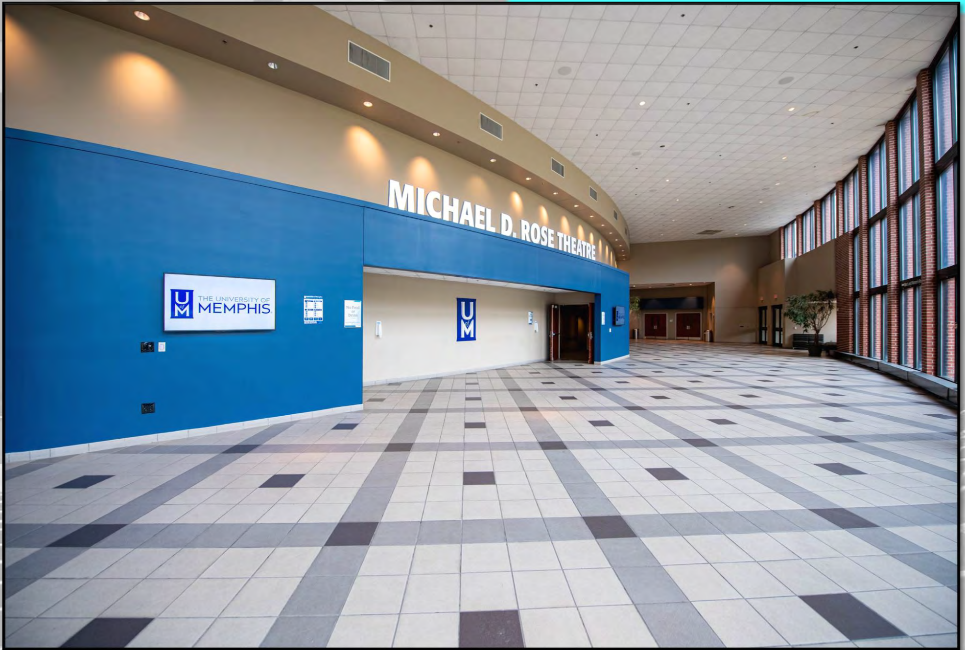
Main Lobby | View to Entertainment Lobby