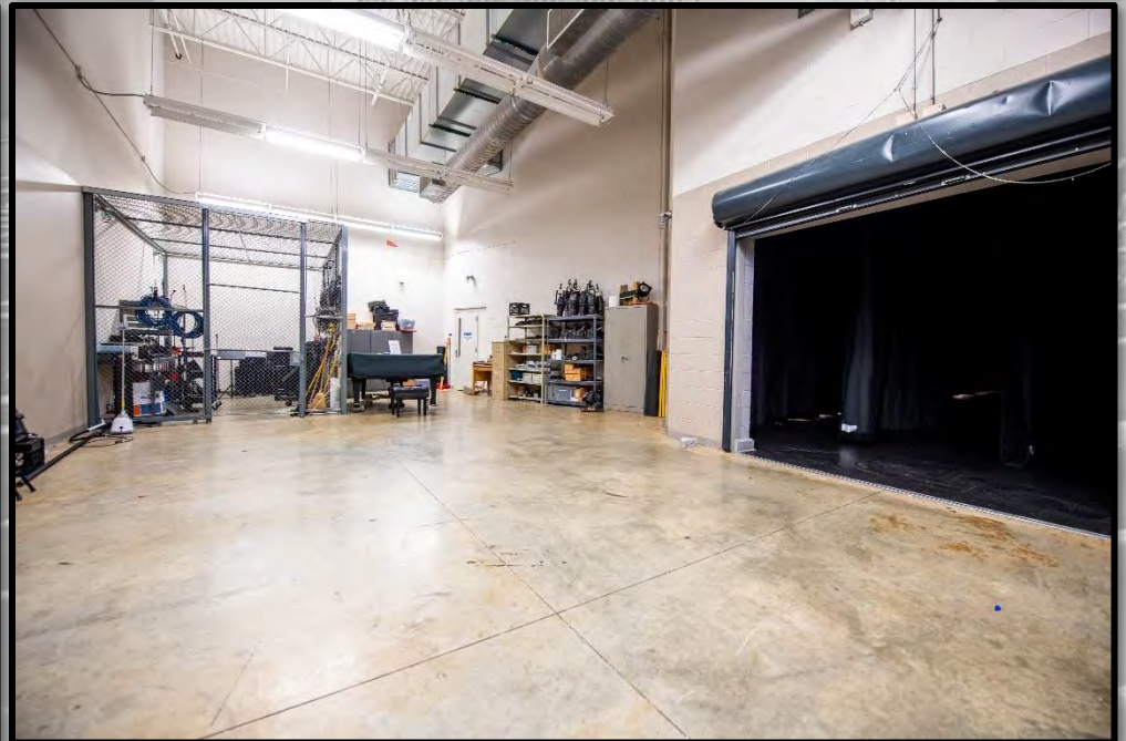
TOP: Green Room & Dressing Room BOTTOM: Backstage Area