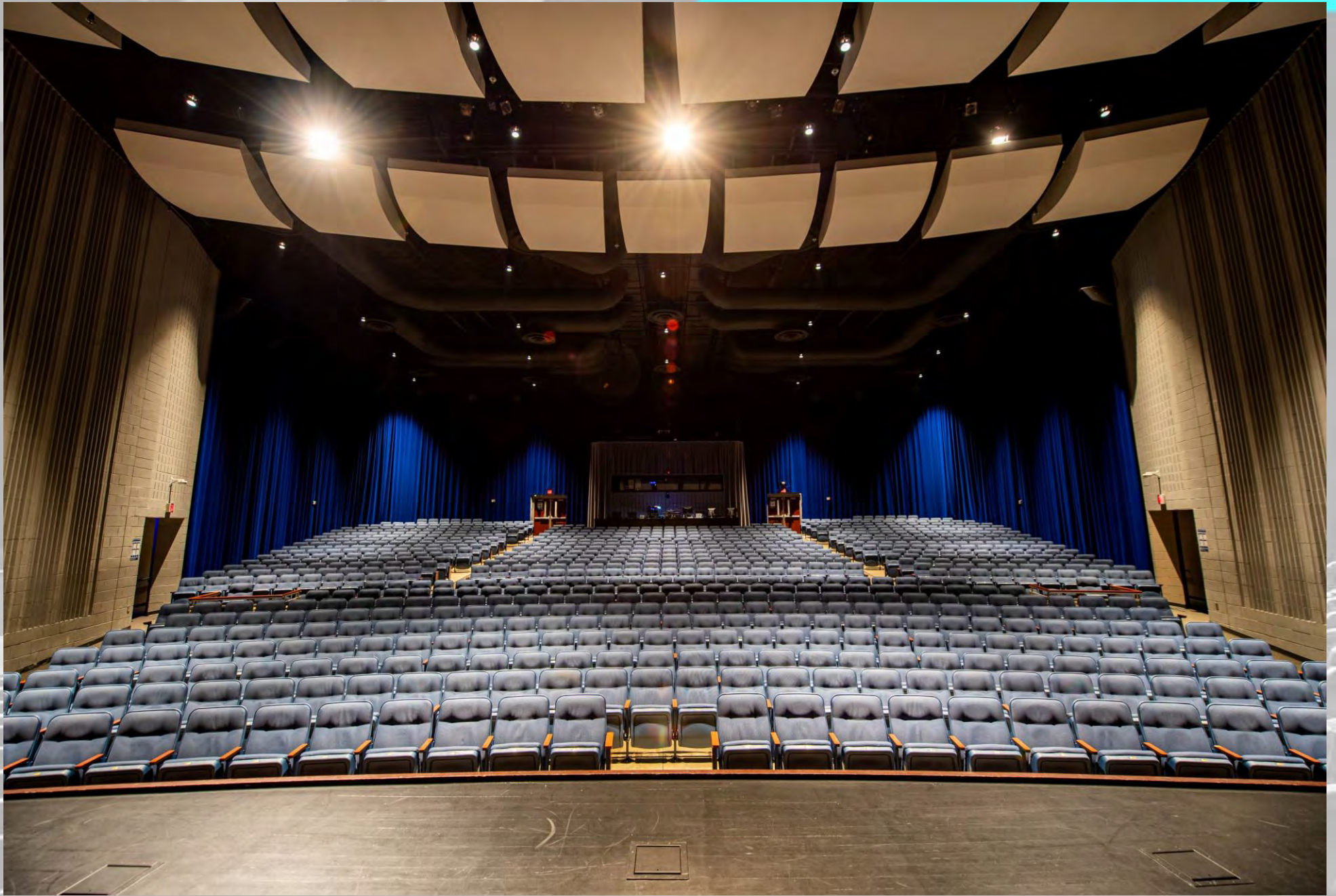
View From Main Stage | Seating Capacity 921