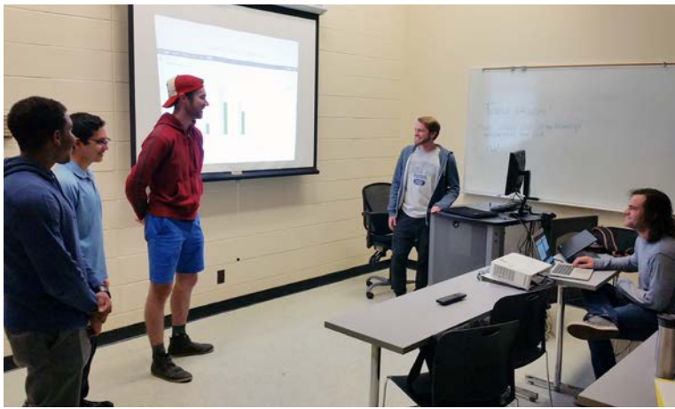
Participants during the Software Engineering Showcase