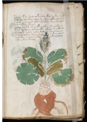
The Voynich Manuscript

The goal of this course is to learn about morphology and syntax for languages of the world. Morphology is the study of words, how they are formed, and their structures. Syntax is how morphemes and words work together to form larger meaning units, such as phrases and sentences. Class will generally follow this pattern: I will provide a lecture and overview of the material, followed by a short break. Then the discussion leader will facilitate a conversation with the class about the readings. Then we will break into small groups for work on class projects and exercises. This course will look at big picture questions and contemporary applications of morphology and syntax in corpus and computational linguistics. You will be evaluated on the basis of class participation, homework, final paper, and a final presentation of your work.