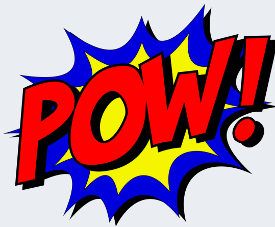
Discover Your Major Day 2025