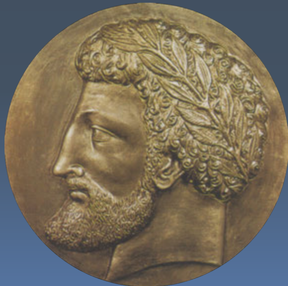
Masinissa (King of Numidia)