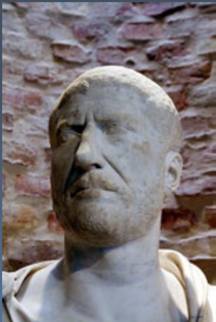
Philip the Arab

Valentinian (364-78 AD) - Pannonia - modern Balkans