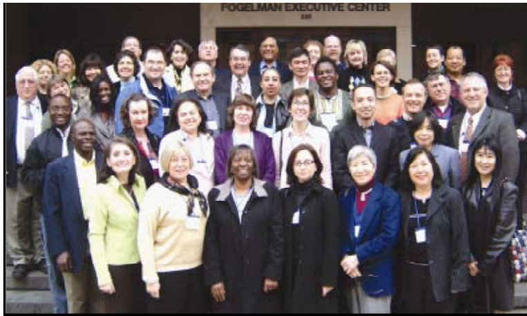
Foreign Language Workshop participants

offered the following statement in a 2005 external evaluation of the IMBA program, "The International MBA program clearly provides the University of Memphis a distinctive competence in a crowded market populated by many undifferentiated MBA programs."