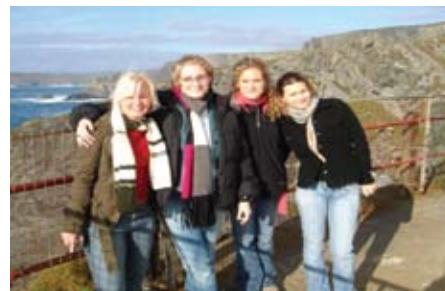
IMBA World Regions Track Students with University of Ulster Students in Ireland

managed by the Wang CIBER. Both programs are interdisciplinary and require the study of a foreign language and international studies curriculum. The International MBA program