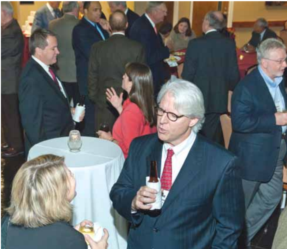
Participants relax at a reception after the Idea Generation event.