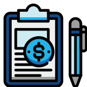
CHART YOUR COURSE TO A CHARTER

Include these courses with your FIR degree path to earn a Financial Analyst Certificate from FCBE at the University of Memphis. Then you'll be better prepared to earn a CFA® credential.