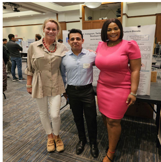
UofM 2024 Student