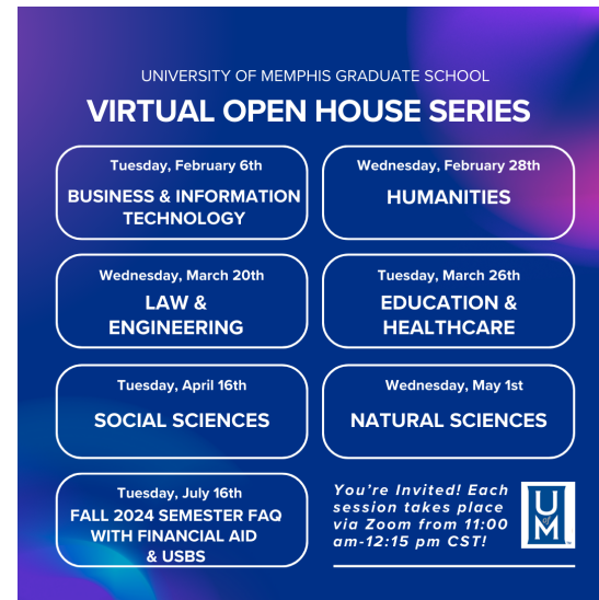
Spring 2024 Virtual