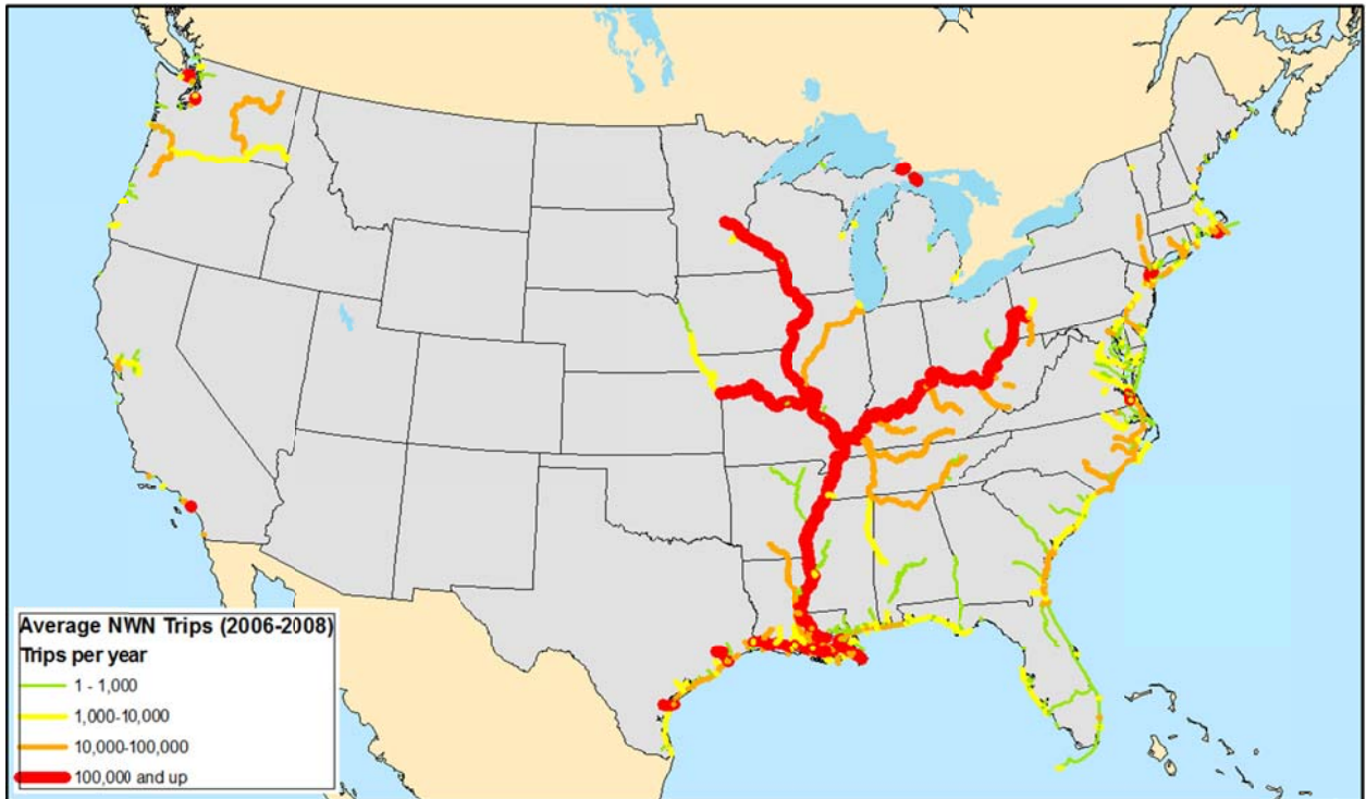
167 168 FIGURE 2 National Waterway Network trips (WCUS data)