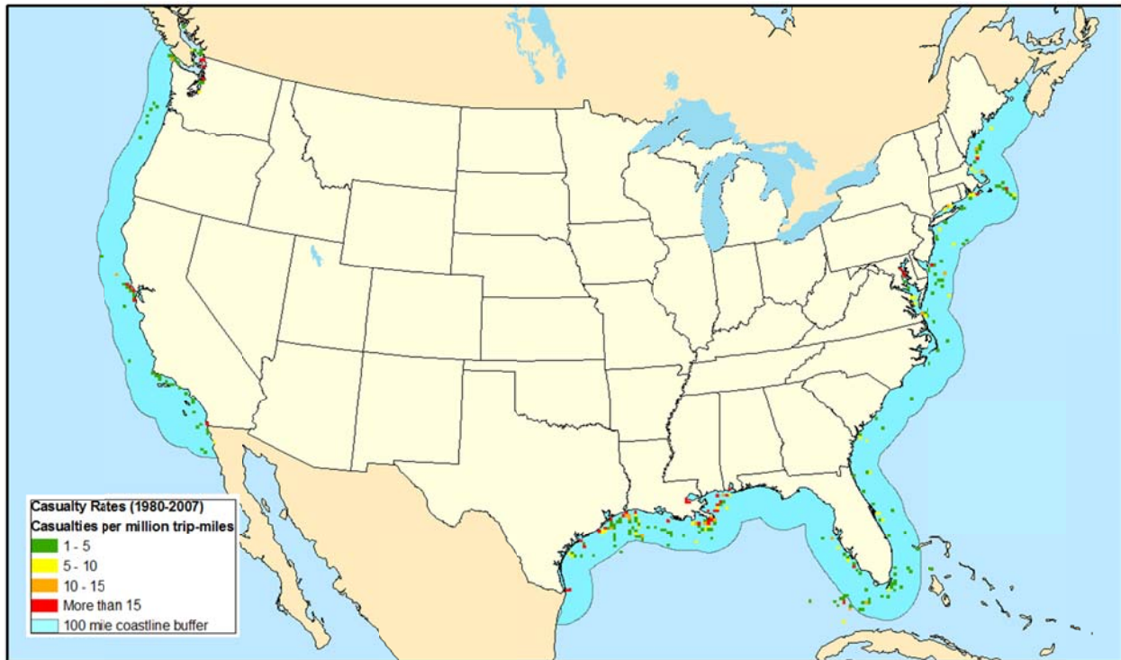
234 235 FIGURE 5 Casualty rates (casualties per million trip-miles, minimum 1,000 trips) 236