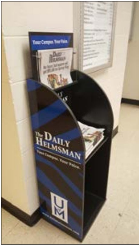
More than 70 new newspaper racks for The Daily Helmsman are now around the U of M campuses and around the city.