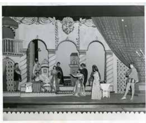
▲ 1955 OPERA