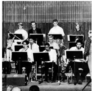
▲ 1995 SOUTHERN COMFORT JAZZ ORCHESTRA