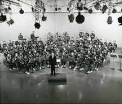
▲ 1956 MEMPHIS STATE COLLEGE BAND