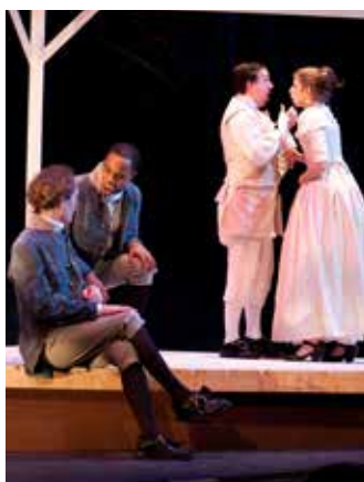
▲ 2009 OPERA