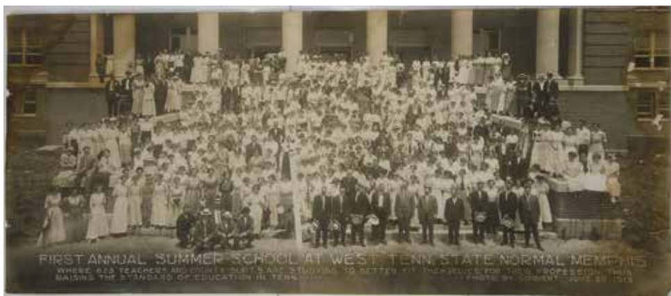
▲ 1913 FIRST SUMMER SCHOOL AT WEST TENNESSEE STATE NORMAL SCHOOL