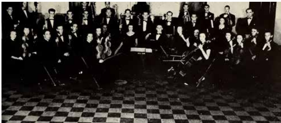
▲ 1949 ORCHESTRA