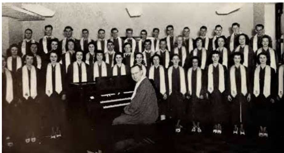
▲ 1949 CHOIR