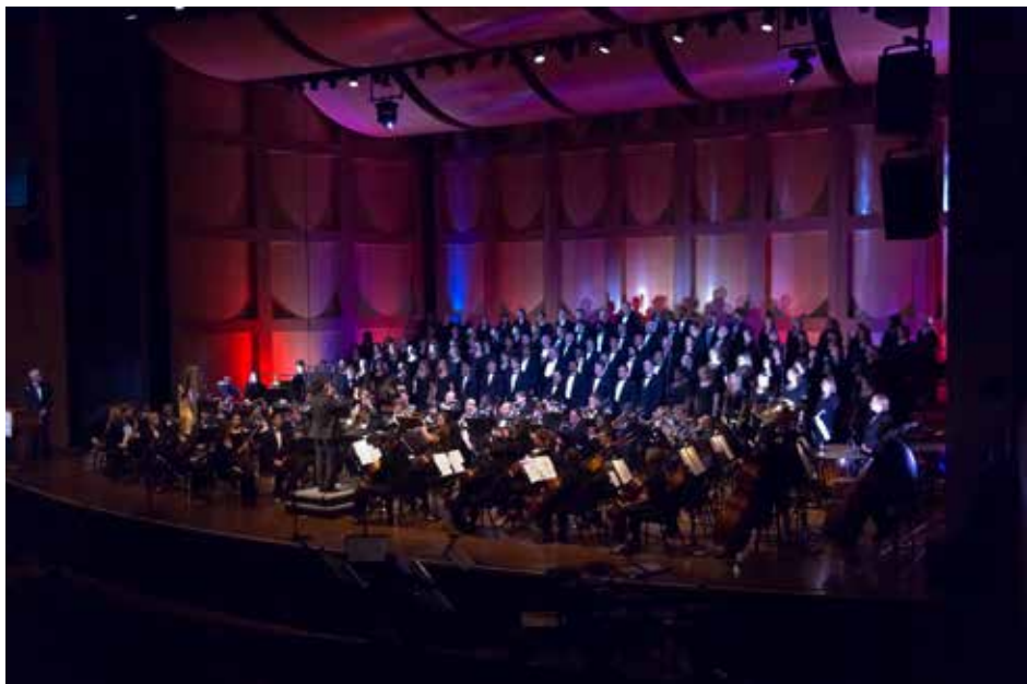
▲ 2012 UNIVERSITY OF MEMPHIS CENTENNIAL