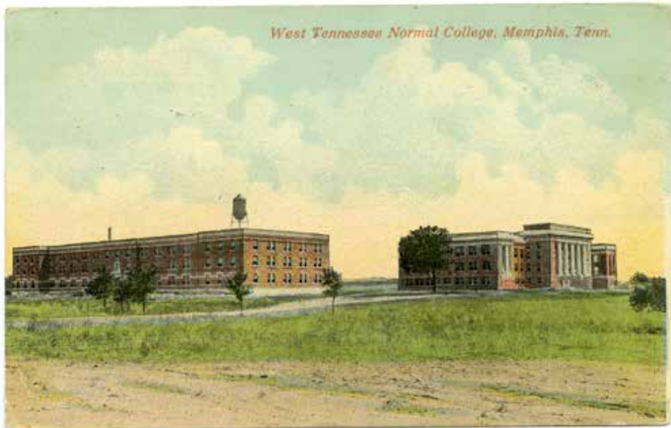
▲ 1912 WEST TENNESSEE STATE NORMAL SCHOOL CAMPUS