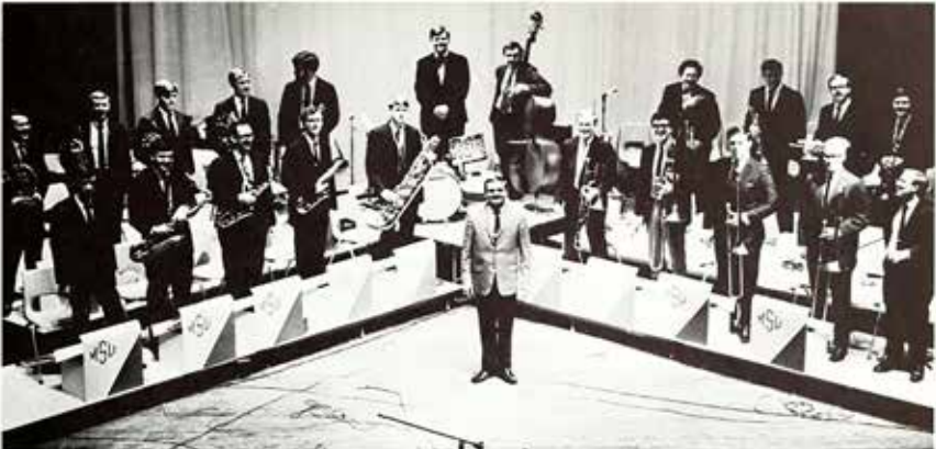
▲ 1969 MEMPHIS STATE UNIVERSITY STATESMEN