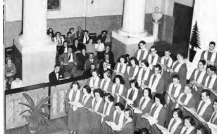
▲ 1947 CHOIR