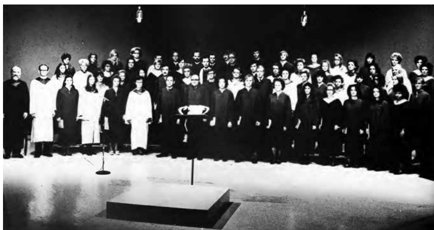
▲ 1972 ORATORIO ON WKNO-TV