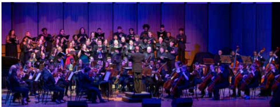
▲ 2023 GRAND OPENING GALA