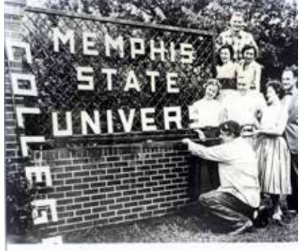
▲ 1957 NAME CHANGED TO MEMPHIS STATE UNIVERSITY