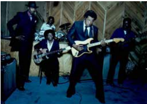
▲ 1979 HIGHWATER RECORDS THE FIELDSTONES