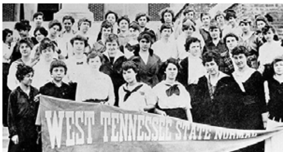
▲ 1913 CLASS PHOTO