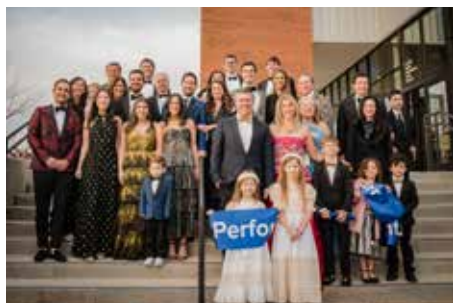
▲ 2023 SCHEIDT FAMILY PERFORMING ARTS CENTER RIBBON CUTTING