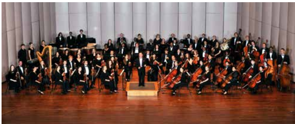
▲ 2008 UNIVERSITY OF MEMPHIS SYMPHONY ORCHESTRA