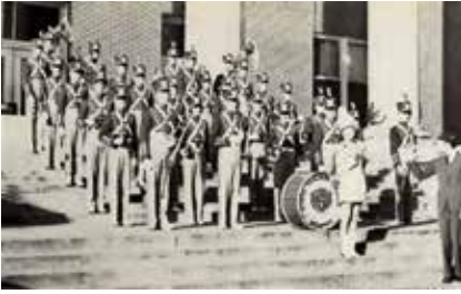
▲ 1940 MARCHING BAND