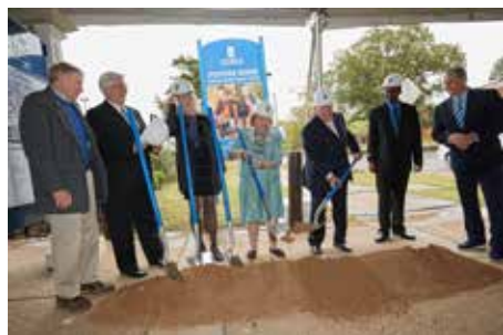
▲ 2017 SCHEIDT FAMILY PERFORMING ARTS CENTER GROUND BREAKING