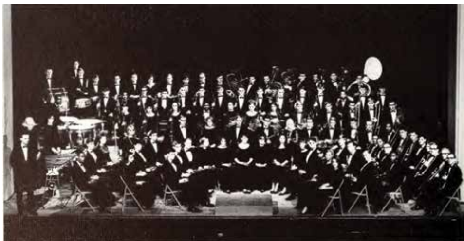
MSU Concert Band