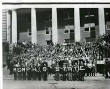
▲ 1941 GRADUATING CLASS