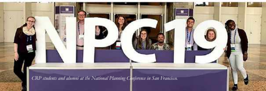
CRP students and alumni at the National Planning Conference in San Francisco.