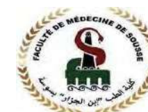
Faculty of Medicine Ibn Al-Jazzar