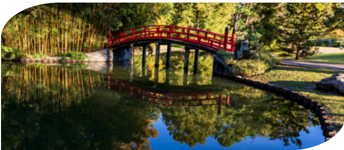
Memphis Botanic Garden