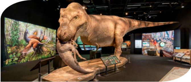
Memphis Museum of Science & History