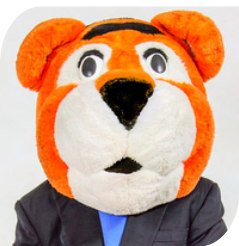
Vacant Project Manager - Facilities