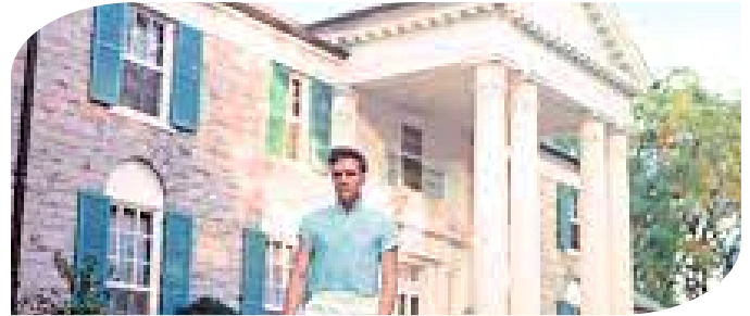
Graceland: The Home of Elvis Presley