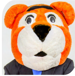
Vacant Senior Associate Director