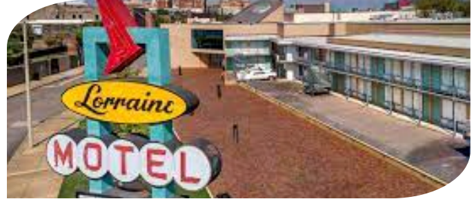
National Civil Rights Museum at the Lorraine Motel