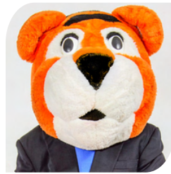
Vacant Residence Life Coordinator Living Learning Complex