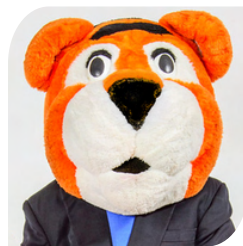
Vacant Graduate Assistant Residence Hall Association Advisor