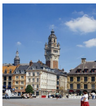
Lille: La Grande Place

The Department of Foreign Languages and Literatures sponsors several programs in France. Our main partner is the Université Catholique de Lille. A private not for profit university founded in 1875, the Université has an urban campus located in the heart of the city, within easy walking distance of the city's cultural and commercial centre. The university hosts a population of 25,500 full-time students.