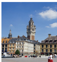
Lille: La Grande Place

The Department of Foreign Languages and Literatures sponsors several programs in France. Our main partner is the Université Catholique de Lille. A private not for profit university founded in 1875, the Université has an urban campus located in the heart of the city, within easy walking distance of the city's cultural and commercial centre. The university hosts a population of 25,500 full-time students.