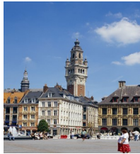
Lille: La Grande Place

The Department of World Languages and Literatures sponsors several programs in France. Our main partner is the Université Catholique de Lille. A private not for profit university founded in 1875, the Université has an urban campus located in the heart of the city, within easy walking distance of the city's cultural and commercial centre. The university hosts a population of 25,500 full-time students.